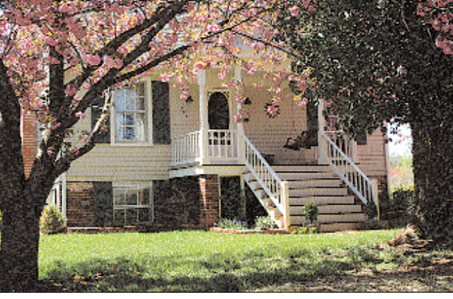
The 1850's toll keeper's house on the Blue Ridge 1863. He ran a gauntlet down the Blue Turnpike (Rt. 231) just outside Gordonsville.

ther up the turnpike sits Tivoli on the hilltop to the left. Built by another