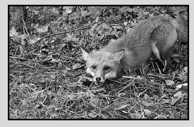
Caught in "pad jaw" trap, a red fox awaits his fate on a farm in the lower end of Orange County.

A "fox pen," is an enclosed area where hunting dog owners can train their hounds to pursue live foxes. In Virginia, these facilities range in size from as little as 100 to as many as 900 fenced-in acres. The closest one to us is in Louisa County. Fox pens appeal more to pickup truck foxhunters than to horseback foxhunters. These guys usually hunt at night and have bumper stickers that read, "When the tailgate drops, the B.S. stops." They pay the pen owners by the hound to chase live foxes inside the enclosure, and they sometimes compete for trophies as to who has the best hound.