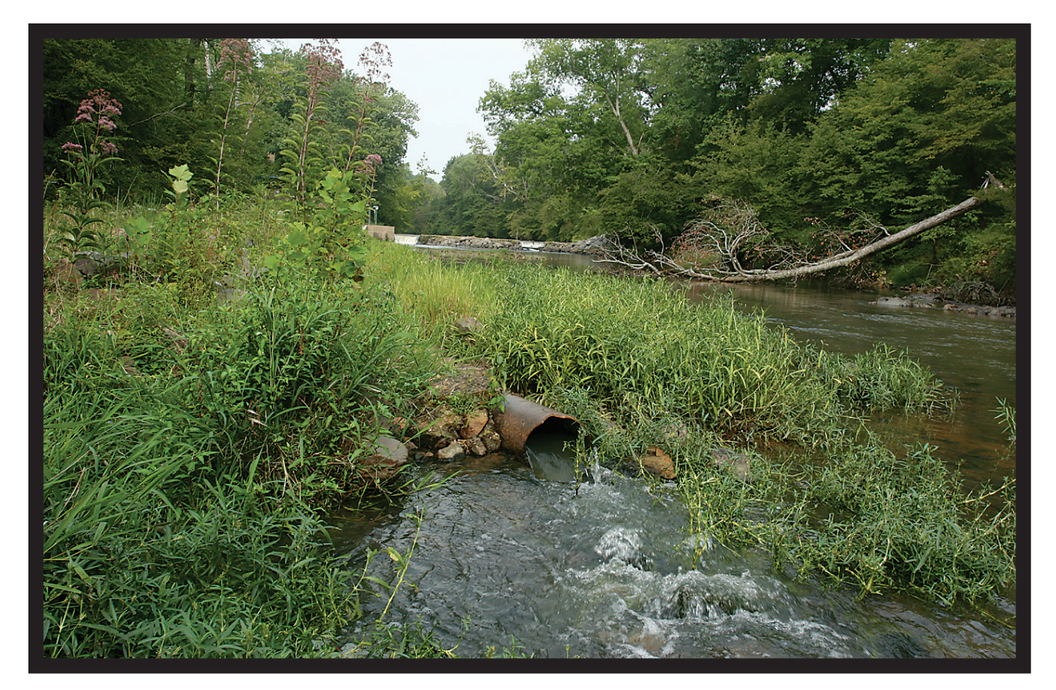
At a rate of about 700,000 gallons per day, treated effluent returns to the river from which it came. Note the spillway in the background where the intake for the town's water supply is located upstream.