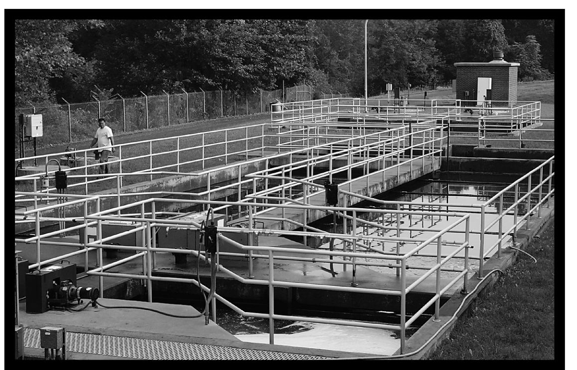
After further purification by trickling filters, effluent meanders through the tanks in the foreground. before being aerated again. In the final tank it is dosed with chlorine and then sulphur dioxide (to remove the chlorine) before heading to the river beyond the small brick building in the background.

She hauls out plans for a new treatment plant that will operate on a different system called "activated sludge." Gone are the trickling filters replaced by a four-stage system with disk filters and ultra violet light instead of chlorine. This is going to be a hard sell, but the town is between a