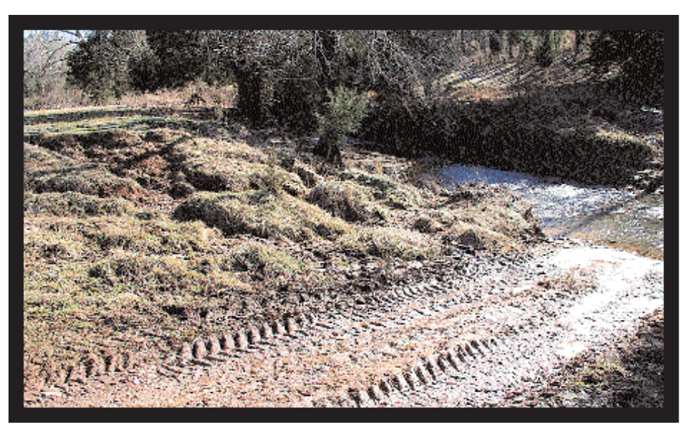
A before and after picture of a livestock stream crossing on the William Nixon farm. Note the erosion to stream banks in the "before" picture, above, and in the "after" picture, below, how the stream ford has been improved by gravel and fencing.