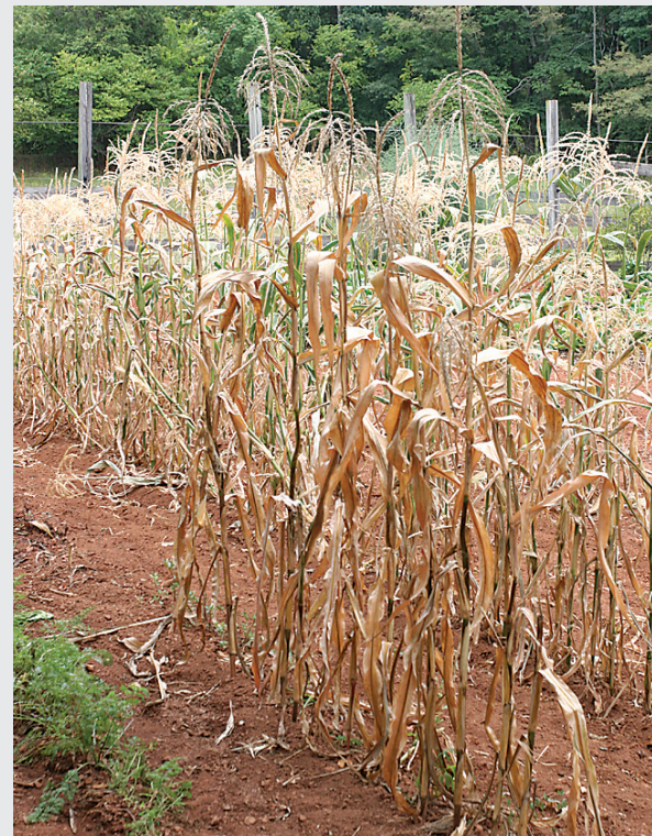
A parched garden in Orange County.

Gentry tells stories of drilling 600-foot dry holes, only to move over a few yards and hit 100 gallons per minute. He says confidently, "In 46 years, I can tell you within a foot where I'm going to hit the bedrock at and within a foot when I'm going to hit the water at."