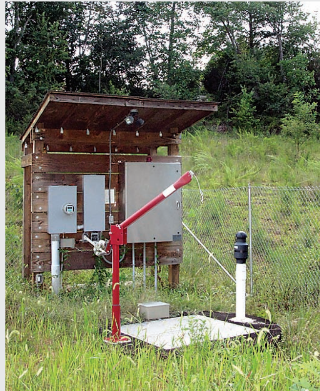
Above, this observation well outside of Gordonsville has steadily recorded an average static water level of about 25 feet ever since 1965. But it fluctuates wildly on a seasonal basis. Below, the USGS constantly monitors the well. The 120-day trend shows the static ground water level has dropped 10 feet since April.

Basically Orange County sits atop two aquifers. One is