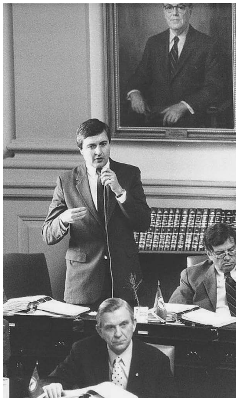
Freshman State Senator Edd Houck was first elected in 1983. Since then, he has faced opposition six times.

He says the Lake of the Woods structure is a model dam, a