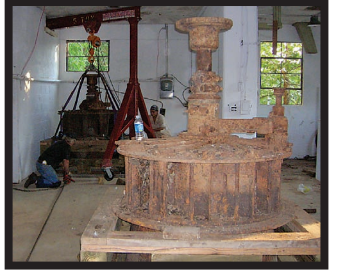
Before and after: an original 1930s-era turbine before being shipped to the Leffel factory in North Carolina, and the same turbine after refurbishment.