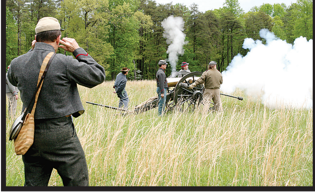
Re-enactors fire a 12-pound Napoleon in observance of the 145th anniversary of the Battle of the Wilderness.

Turn left on Everona Road, Rt. 617. At Rt. 522, go straight across the road onto Mine Run Campaign. Pine Stake Road, Rt. 621. When you reach the Orange Turnpike, Rt. 20, turn left and go to Locust Grove. Turn in and stop at the Town Center and note that yellow house behind the shopping center is actually the original Robinson's Tavern that has been moved back from the Orange Turnpike.