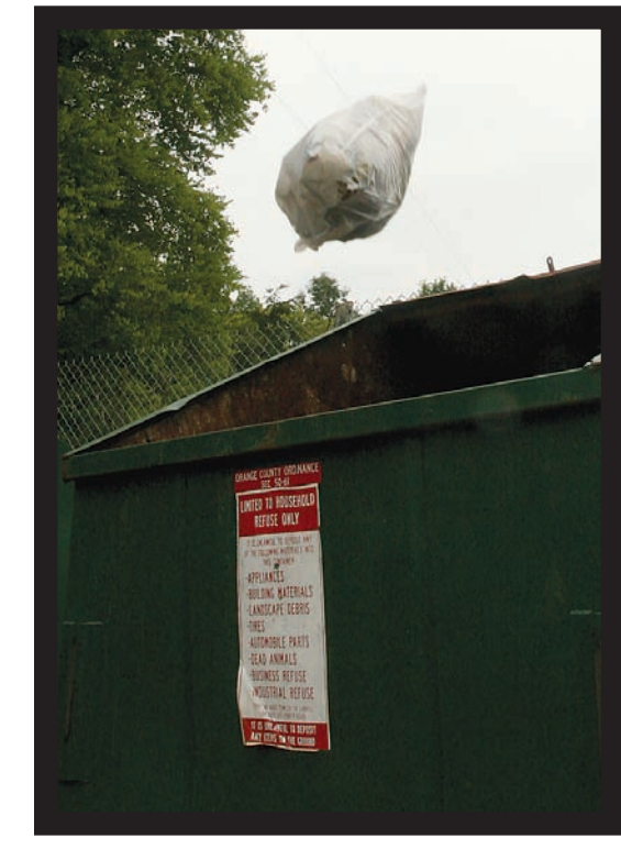
The beginning of the journey from the dumpster to the landfill for a typical household trash bag.

Daily, an average of 3.1 pounds of trash is disposed for every man woman and child in Orange County.