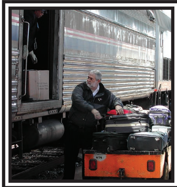
Loading luggage in Birmingham.

And the meals were included! They were not what you'd call gourmet, but they sure beat the stuffing out of that excuse for a snack that you now have to buy on board an airplane. Three full meals, with a real multiple choice menu, served on a real table with real silverware, not plastic, and real cloth napkins...and an almost real table cloth and almost real looking plastic flowers.