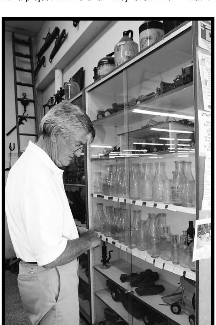
postcards of Orange County, pocket watches, knives, and old milk bottles. Some of the farm implements on the walls at Faulconer Hardware belonged to his grandfather.

She doesn't wait for an answer as she and her father and brother head out the door for lunch, leaving Faulconer Hardware in numerous capable hands.