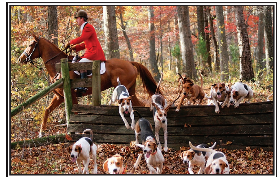
THE HOUNDS TAKE THE COOP BUT THE HUNTSMAN HAS DIFFERENT PLANS ON A BEAUTIFUL AUTUMN DAY JUST OUTSIDE THE TOWN OF ORANGE.

IT HAS LITTLE TO DO WITH CATCHING FOXES. IF IT DID, THEY'D CALL IT FOX-CATCHING, NOT FOXHUNTING.